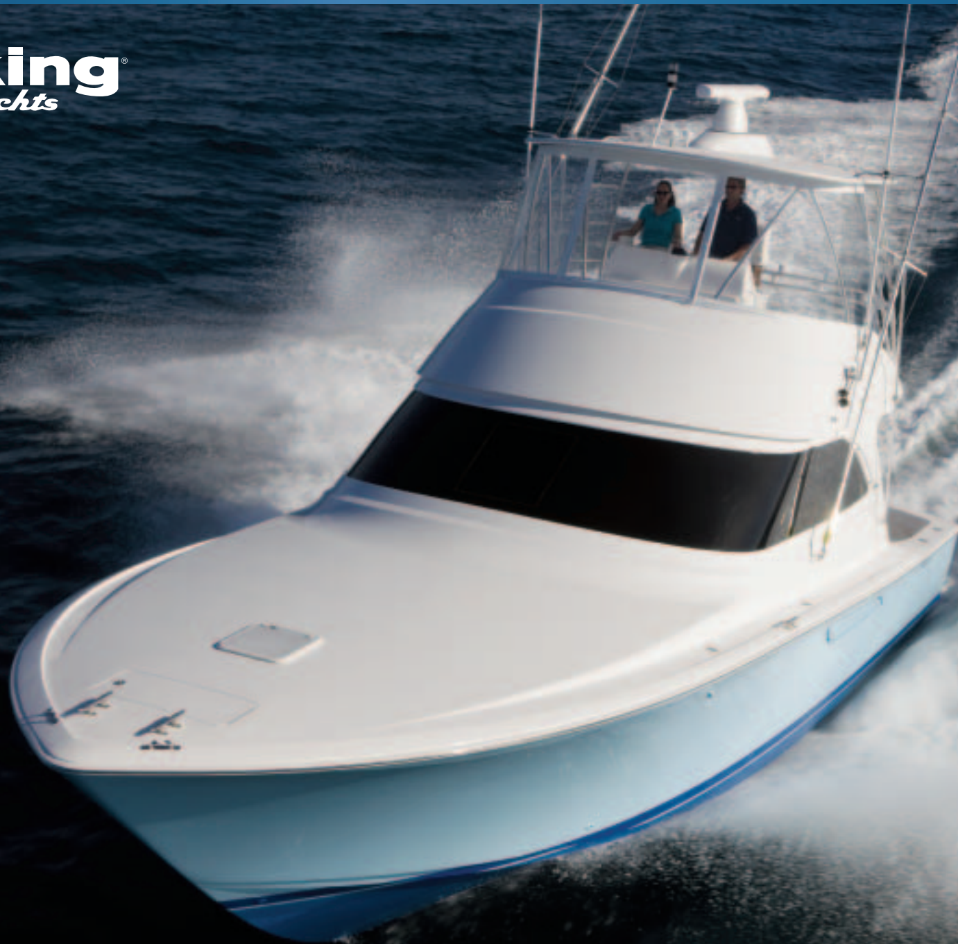
VIKING 42 CONVERTIBLE