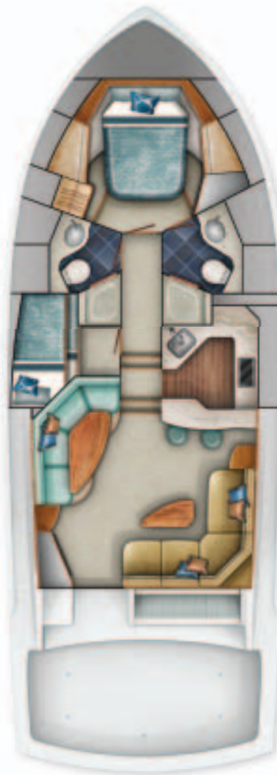
Standard Two Stateroom